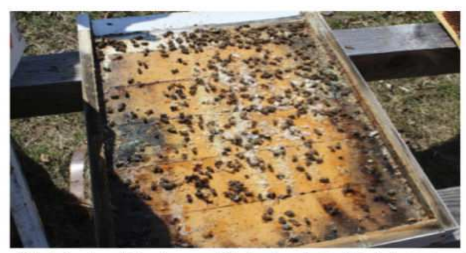
Figure 3. Picture of the bottom board taken from one of the dead neonicotinoid-treated colonies on March 1<sup>st</sup>, 2013. The numbers of dead bees in the six dead CCD colonies ranged from 200-600 dead bees.

As noted above, the study claimed "The absence of dead bees in the neonicotinoid-treated colonies..." This statment is contradicted by Figure 3 which states there were from 200 to 600 dead bees on the bottom boards of the neonicotinoid-treated hives. There is no mention of whether or not there were dead bees in the clusters in the frames or around the exteriors of the hives.